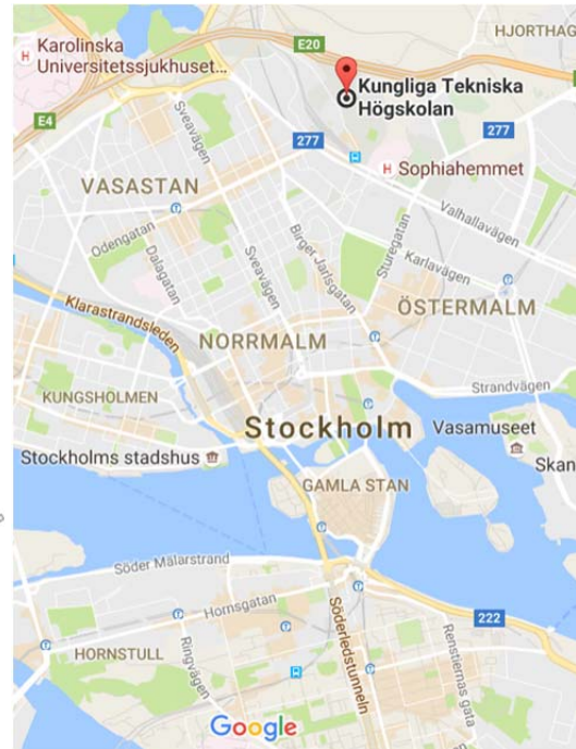
Map of KTH Campus with route to F3 marked